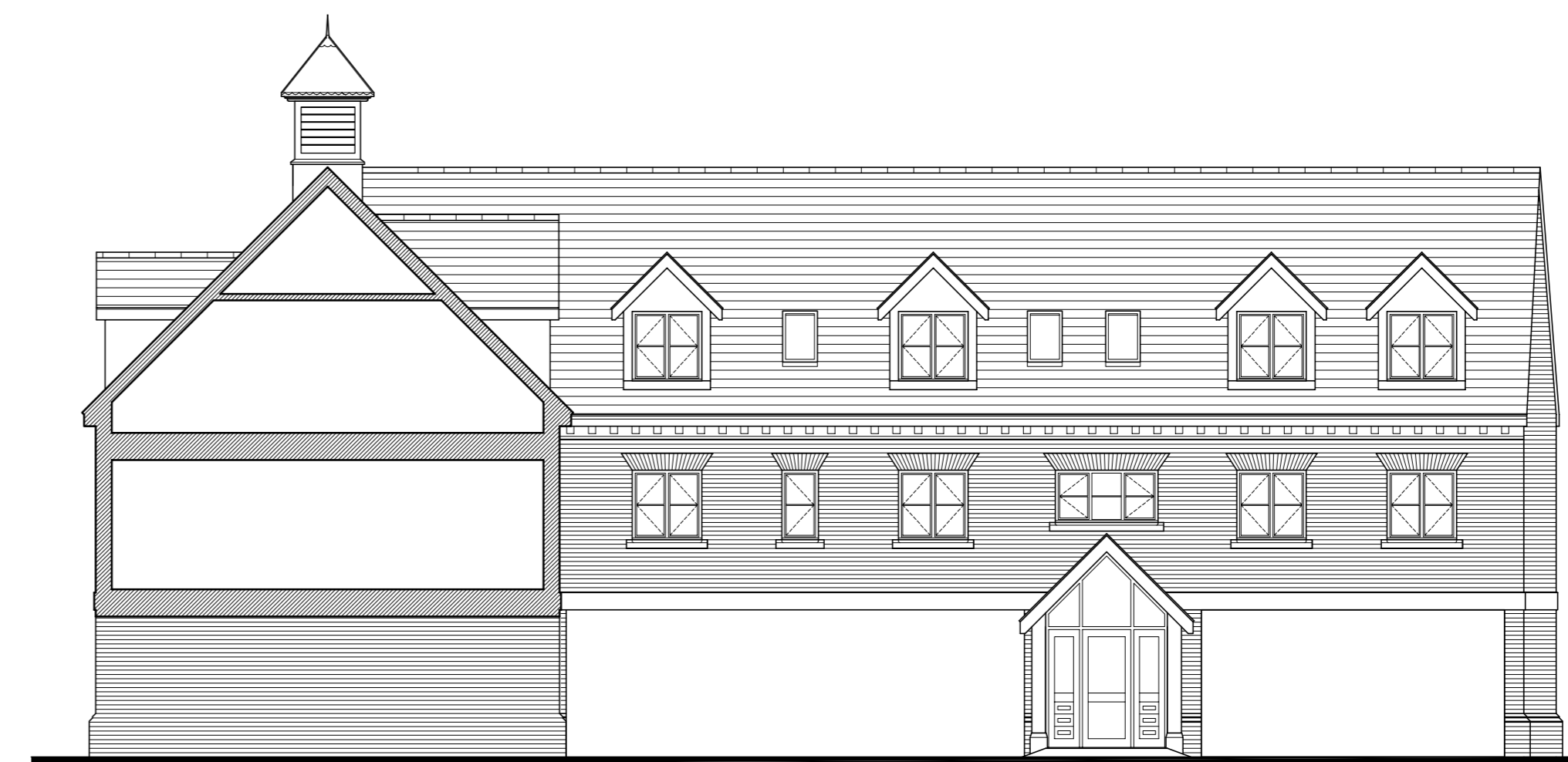
SIDE ELEVATION (TO COURTYARD)