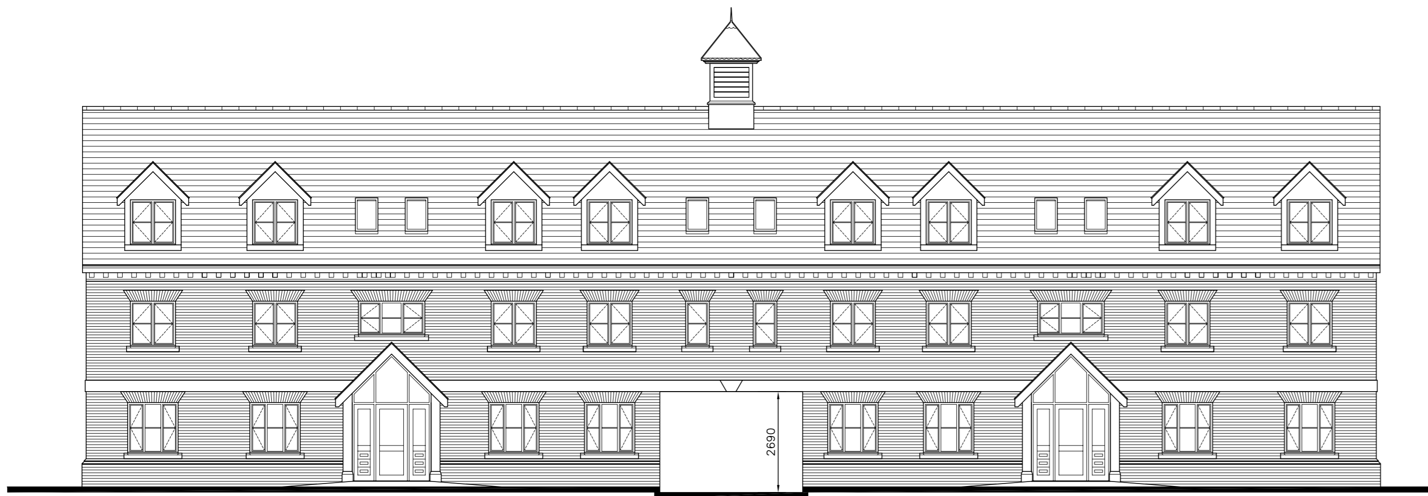
FRONT ELEVATION (TO NAYLAND ROAD)