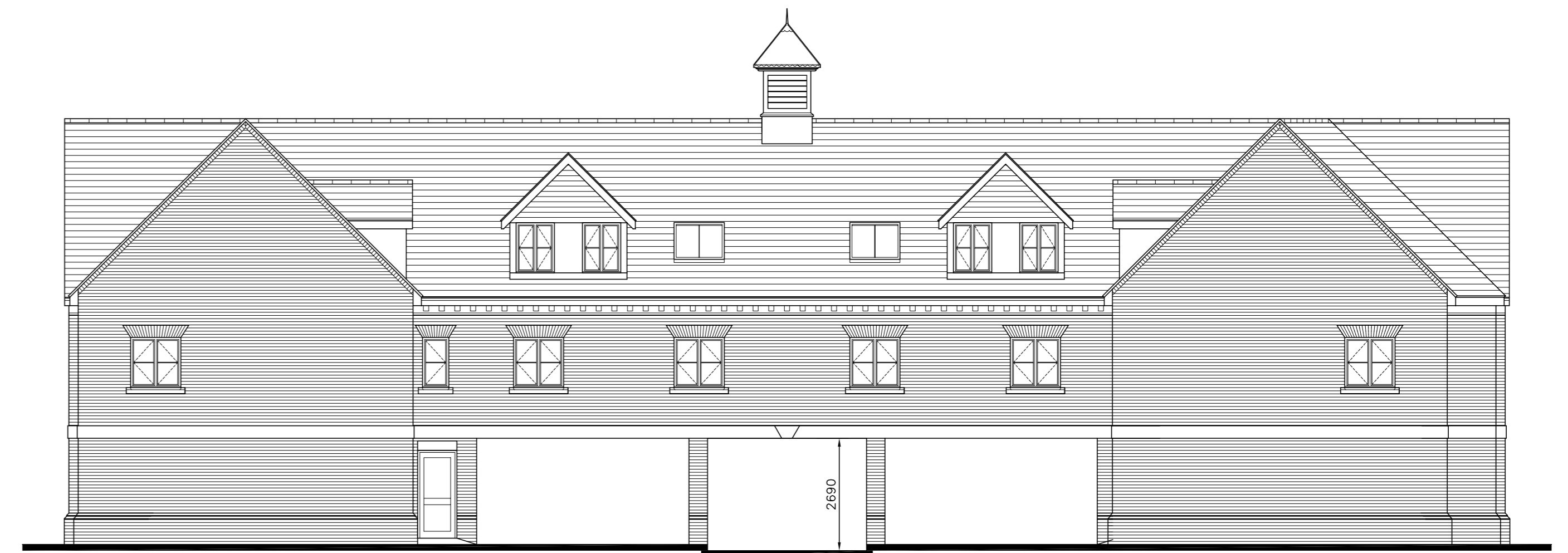
REAR ELEVATION (TO COURTYARD)